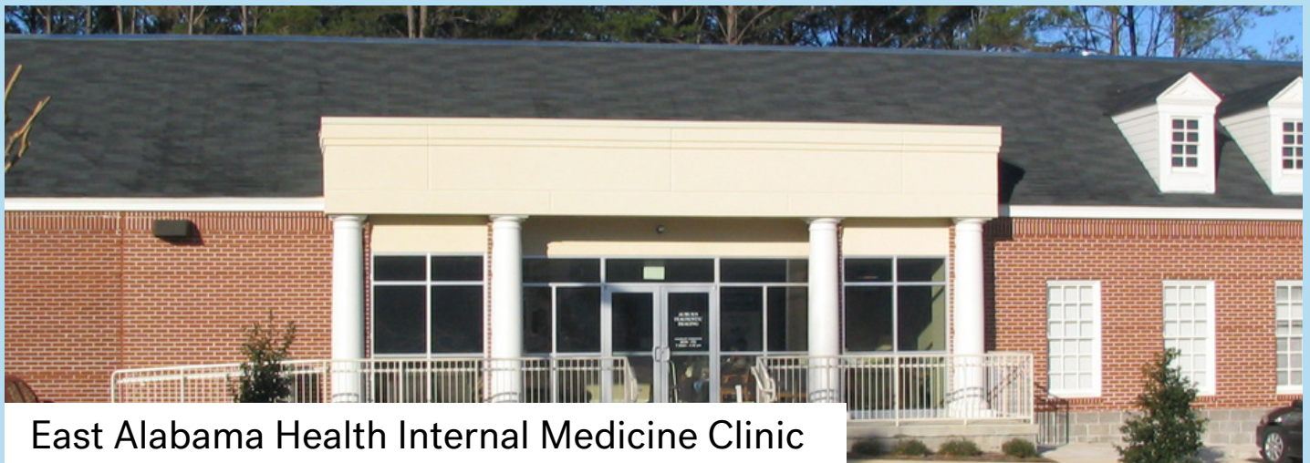
East Alabama Health Internal Medicine Clinic

Our resident continuity clinic is continuing to accept new patients. If you know of someone in need of a primary care physician, please send them our way! New patients can call the clinic at 334.364.3300 to set up an initial appointment. We take Medicaid, Medicare, and several private insurances. The clinic is located at 1527 Professional Parkway, the former Auburn Diagnostic Imaging building in Auburn.